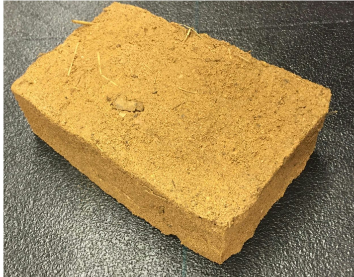
Figure 2. A mud brick created by the team, potentially used in place of cinder blocks.

Exactly what materials are available in Ile-a-Vache is still unclear. In the event cinder blocks are not readily available or are cost prohibitive, the team is also investigating the possibility of using mud brick (Figure 2). Testing will include the suitability of this mud brick for use in an incinerator design.