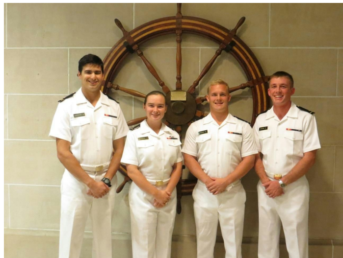
Figure 3. Team Phoenix, ready for incinerator testing!